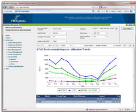
Track and manage your building's environmental performance.

Sustainability is top of mind these days in the building and FM industry. There is more pressure than ever to make your buildings and organization more environmentally friendly – but where do you start? What elements should you consider? How can you track the results of your projects? And how much is creating a more sustainable workplace going to cost?