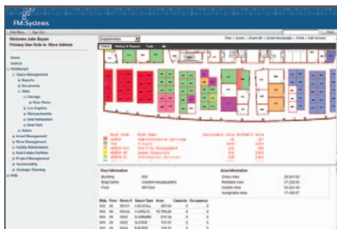
Visualize departmental occupancy to uncover "hidden" vacancy.