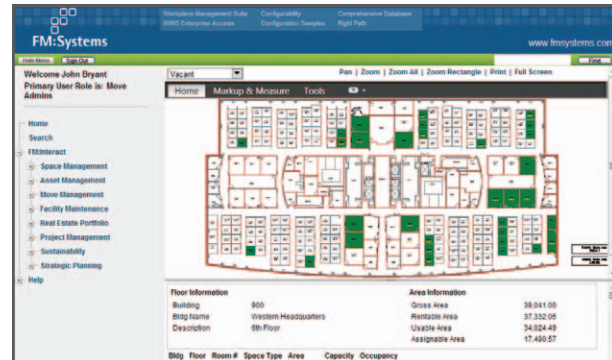
Graphic views give you a quick glance into the space types on your floor plan.

Now you'll need to select the "move to" room. Using the floor plan viewer in your browser you can easily see the spaces that are available – select the vacant workspaces view, or maybe the color-coded by department view. Choose the space by simply clicking through, and once again the system is instantly populated. The FM:Interact Move Management Module automatically updates the Space Management Module, ensuring your space and occupancy inventory is in real-time and reflects all the latest changes.